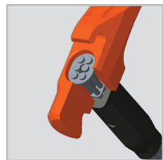
Steel Locking Plate