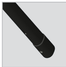
Ergonomic Rubber Grip Handle