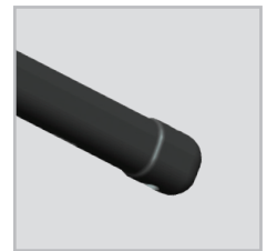
Ergonomic Rubber Grip Handle