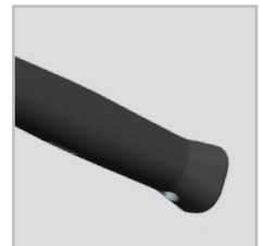
Ergonomic Rubber Grip Handle