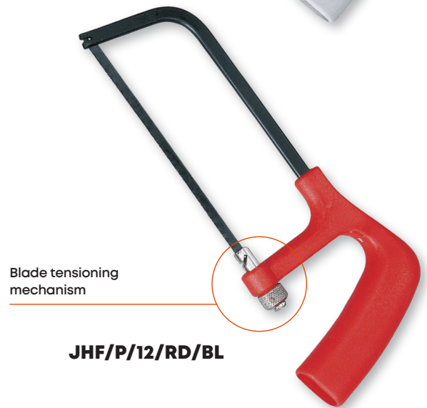
Blade tensioning mechanism