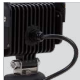
Finned design offers excellent heat dissipation