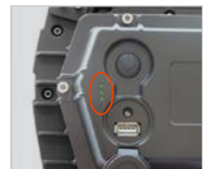
3 LED battery level indicator