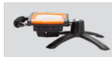
Tilt & swivel to 360°