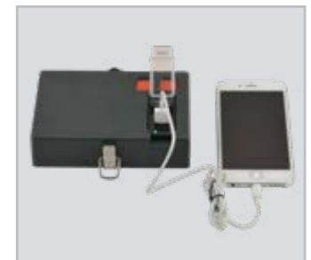
In-built power bank to charge mobile devices