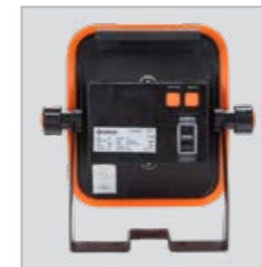
Rechargeable Li-ion battery