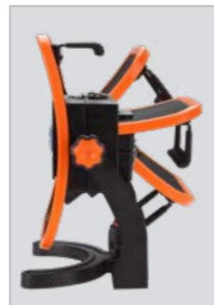
Mounting bracket pivots full 180° to focus light as required