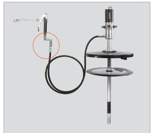
360° Z Swivel

Allows for convenient movement of the control valve & prevents the high pressure hose from kinking