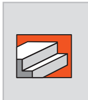
Makes rabbet cuts in wood for door frames, windows, furniture and cabinet carcasses