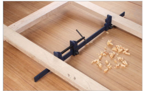
Duo Bar used for internal clamping

Internal clamping is especially useful for holding window or door frames in position or holding partitioning in place during construction etc.