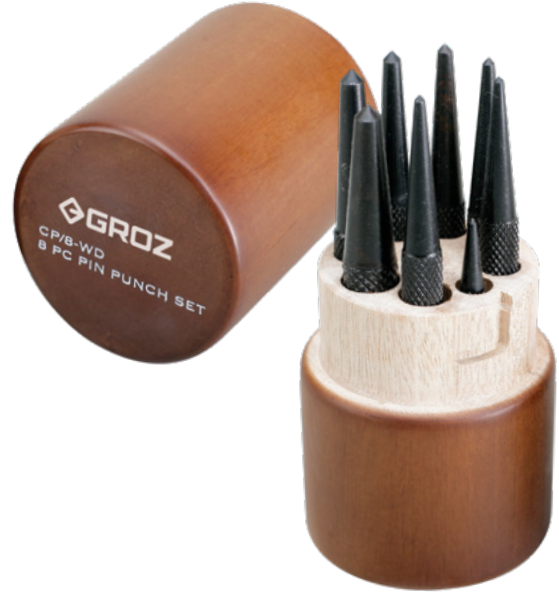
CP/8/WD/ST (Set in a wooden box)

Ideal for clearly marking metal in work layout & making indentations in a work piece before drilling to ensure correct location of drill points