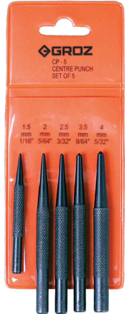
CP/5/ST (Set in vinyl pouch)