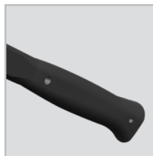
Ergonomic Rubber Grip Handle