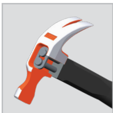
Steel Locking Plate