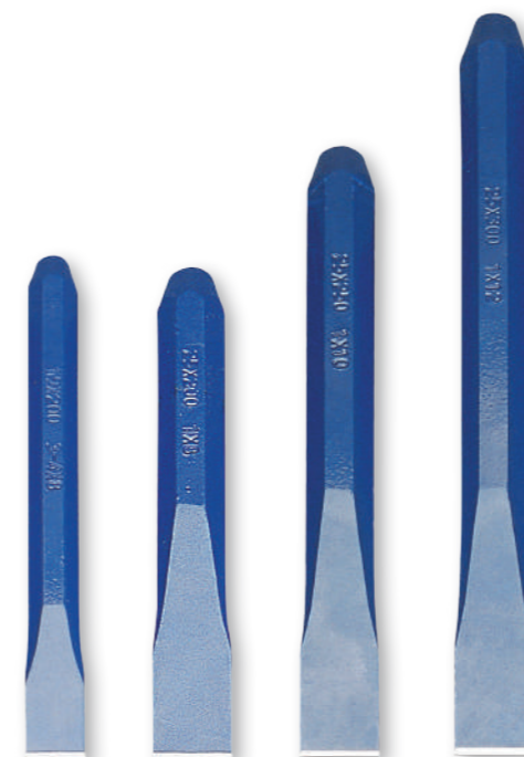
Octagonal Cold Chisels