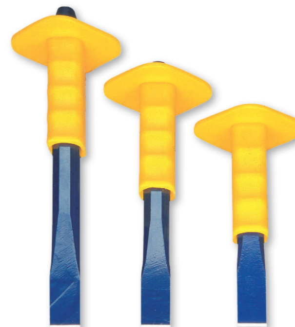
Octagonal Cold Chisels with Guard