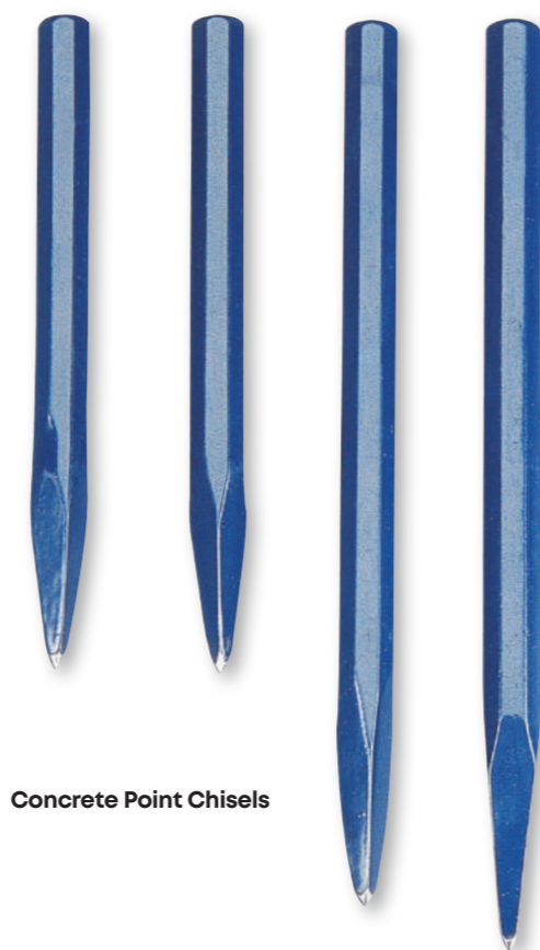
Concrete Point Chisels